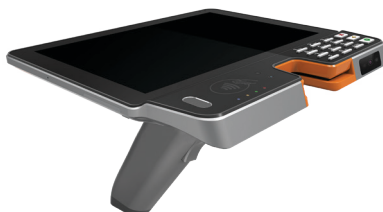
Aries8 Pro Tablet on pistol grip handle