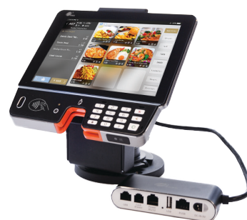
Aries8 Pro Tablet installed on POS stand